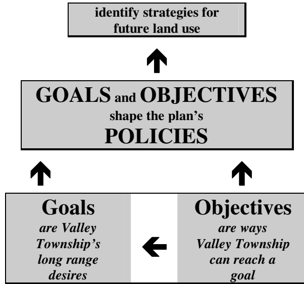
Goals, Objectives, and Policies of the Plan

The planning issues presented in the following pages are not intended to be all inclusive. Rather, they are presented as the primary issues that the community must address as it establishes a future for itself. These issues will evolve over time and should be reexamined periodically and the appropriate modifications made.